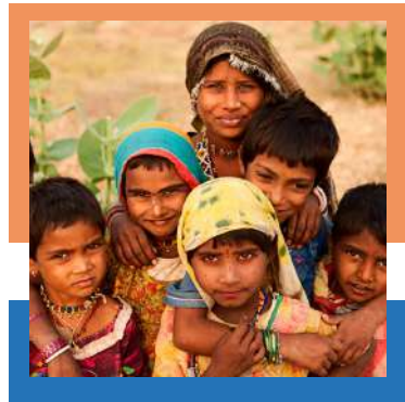
Health & Hygiene

Human Resources & Handle Manufacturing Operations